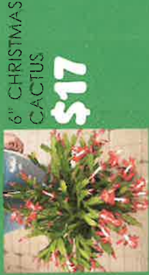
6" CHRISTMAS CACTUS $17

ALL ORDERS THIS YEAR ARE ONLINE. PARENTS SHOULD HAVE RECEIVED A WELCOME EMAIL FROM FUNDRAISE IT WITH INSTRUCTIONS. If you did not get an email, you may use the QR Code above to access your students unique web order address.