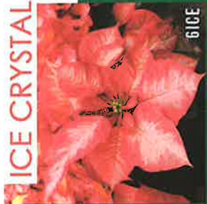
ICE CRYSTAL 6ICE