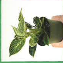
6" PHILODENDRON BIRKIN $16