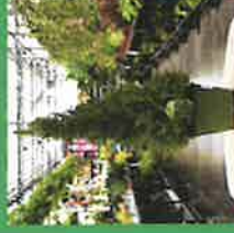
6" ROSEMARY TREE $22