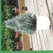
6" LAVENDER TREE $22